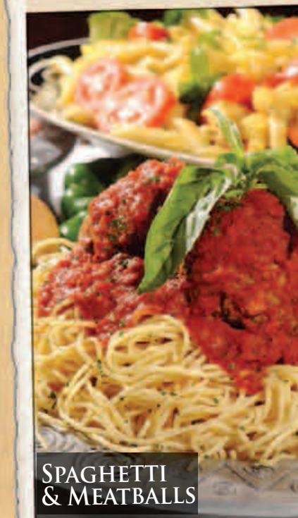
SPAGHETTI & MEATBALLS