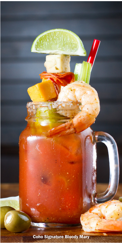
Coho Signature Bloody Mary