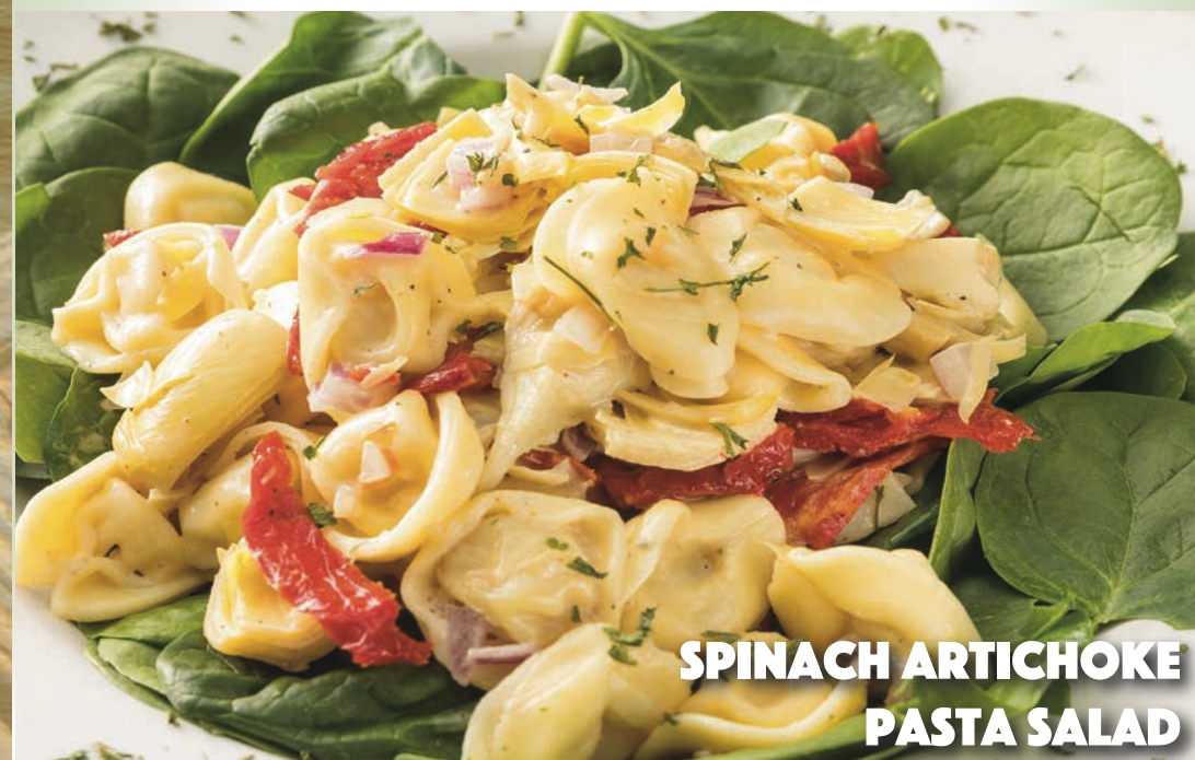
SPINACH ARTICHOKE PASTA SALAD