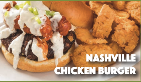
NASHVILLE CHICKEN BURGER