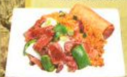
Pepper Steak Combo