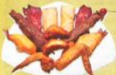
Pu Pu Platter