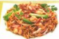
House Special Lo Mein

We can adjust spicy to your taste, or omit sugar, salt at your request!