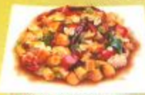
↖ Kung Pao Chicken