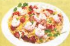
House Special Fried Rice