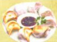
Fried or Steamed Dumplings(8)