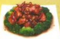
↖ General Tso's Chicken