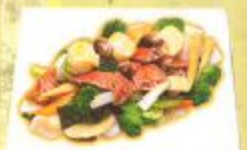
Beef w. Scallop