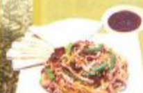
Moo Shu Pork