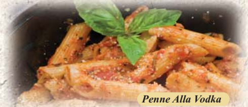
Penne Alla Vodka