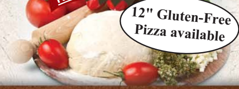
12" Gluten-Free Pizza available

Our Sauce is made with Fresh Packed Tomatoes! NOT FROM CONCENTRATE