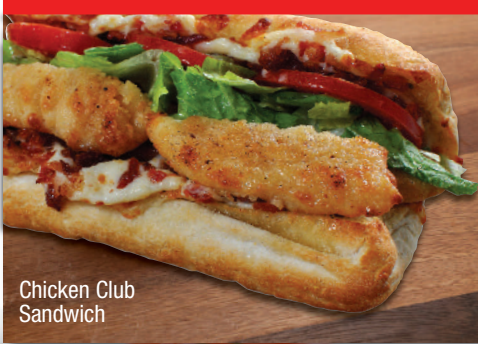
Chicken Club Sandwich