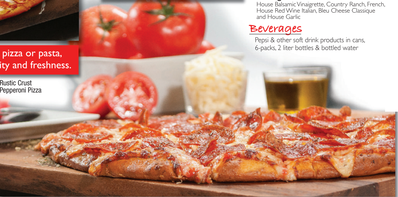
Rustic Crust Pepperoni Pizza