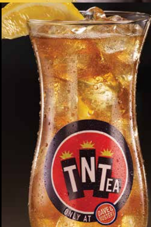
D&B TNT Tea®