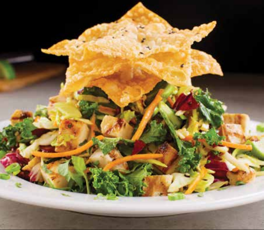
Thai Chicken Chopped Salad