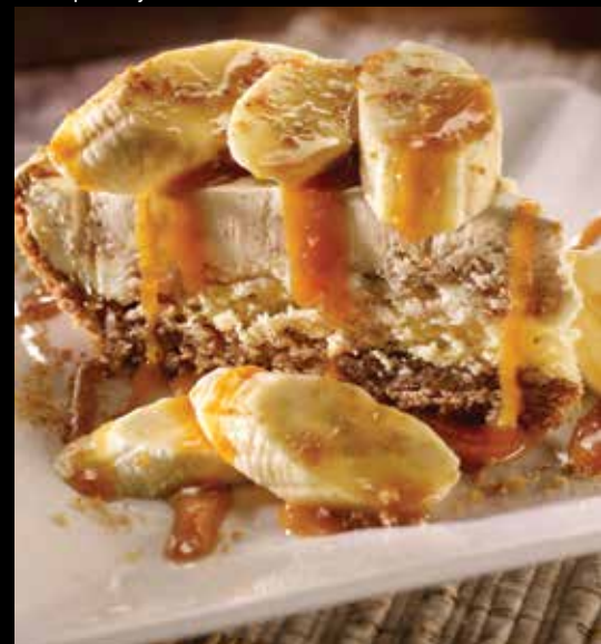
Bananas Foster Pie

TO VIEW ALL OF OUR ALLERGY MENUS, VISIT daveandbusters.com/eat/#allmenus