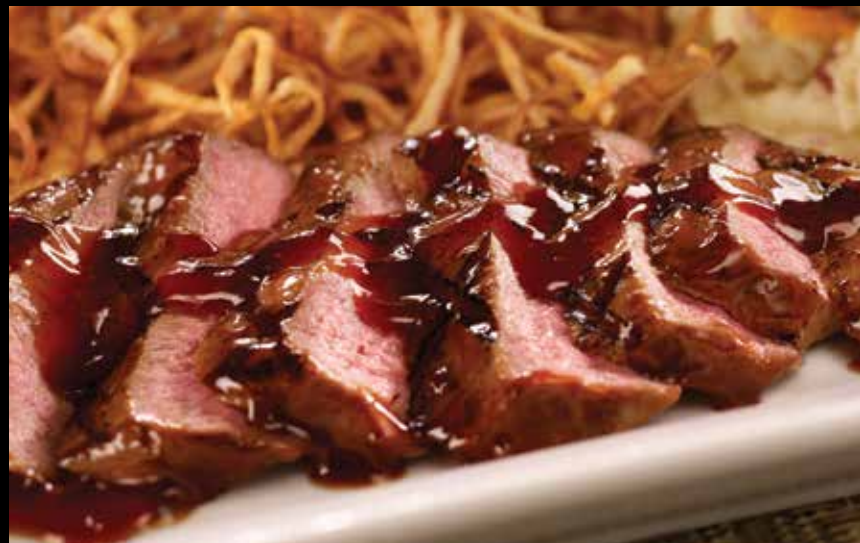
Teriyaki Sirloin Steak*

8 oz. fire-grilled sirloin hand-seasoned with fresh cracked pepper. Served with loaded garlic mashed potatoes and crispy frazzled onions.