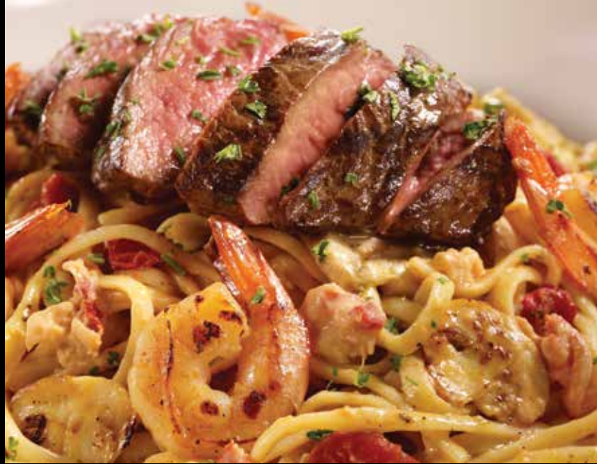
Bistro Steak & Shrimp with Lobster Alfredo Linguine*

Two 5 oz. flame-grilled chicken breasts topped with pineapple pico de gallo and served with spicy rice and steamed fresh vegetables.