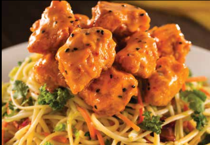
Bang Bang Chicken with Spicy Thai Peanut Noodles