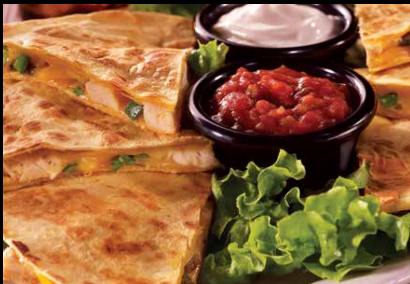
Grilled Chicken Quesadillas