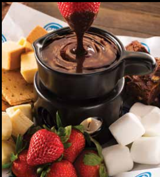
Decadent Chocolate Fondue