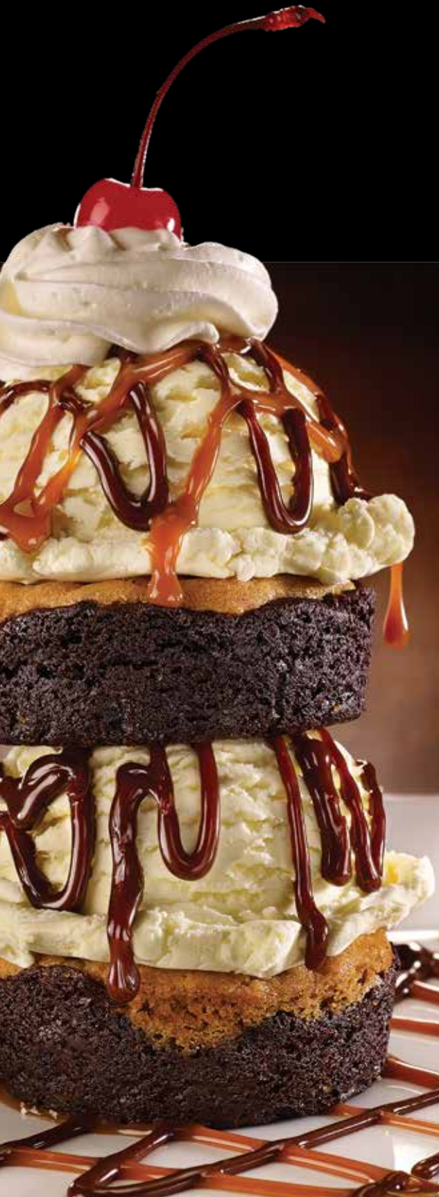
Brookie Sundae Tower

Our classic NY cheesecake with graham cracker crust. Served with warm caramel and pecans or with berry sauce.