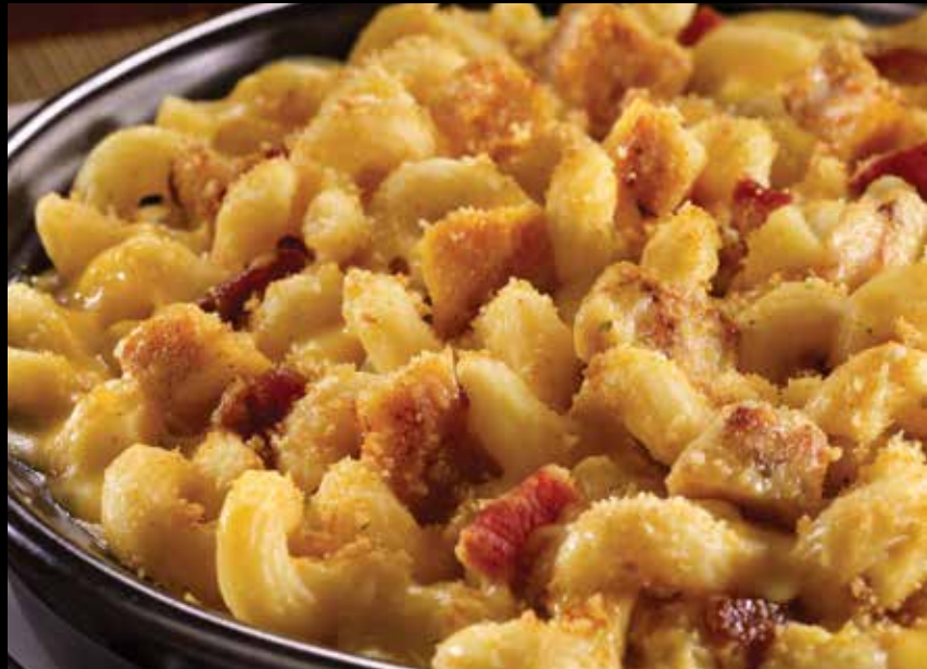
The Ultimate Mac & Cheese