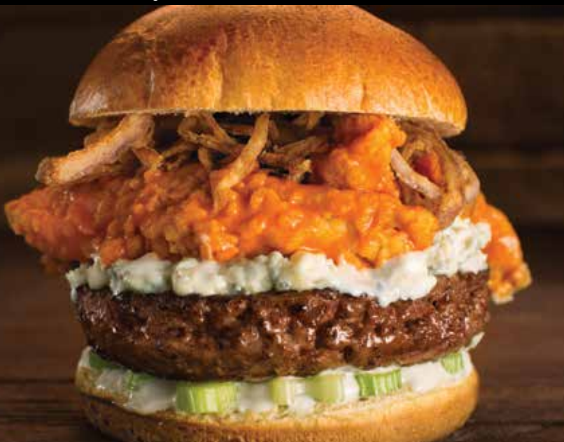
Buffalo Wing Burger*