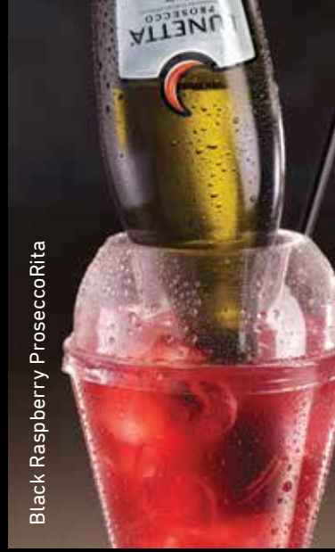
Black Raspberry ProseccoRita