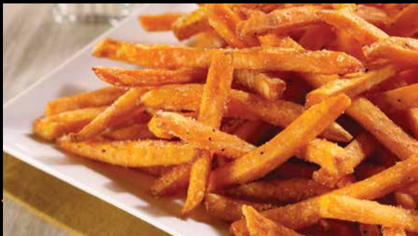
Sweet Potato Fries