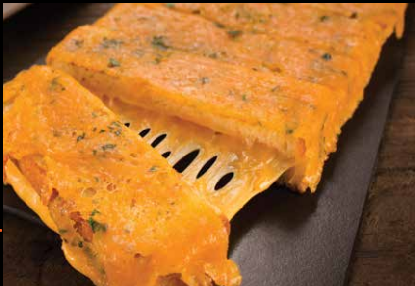
Three-Cheese Grilled Cheese Sticks