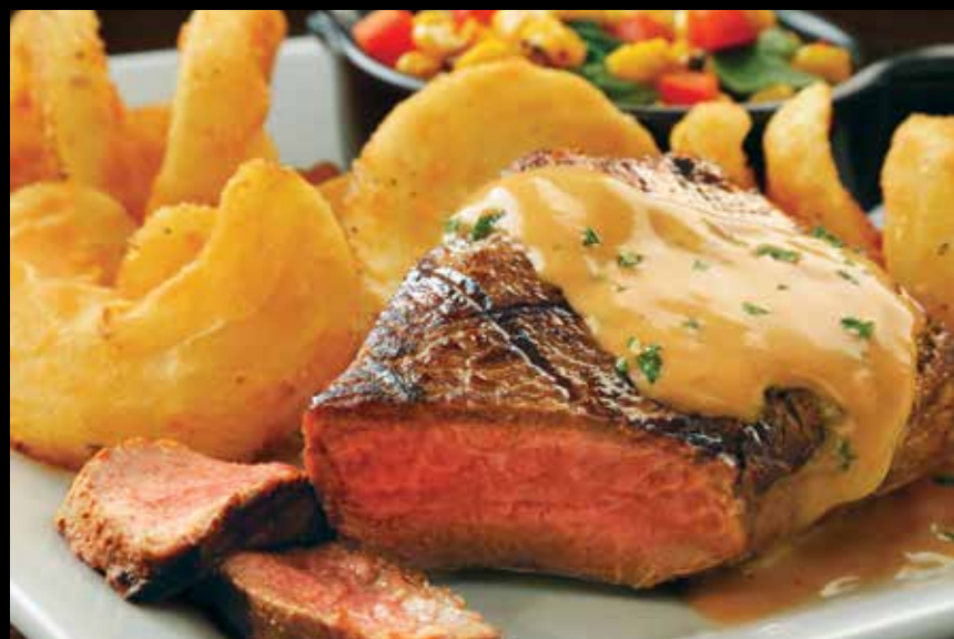
New York Strip Steak Frites with Creamy Marsala Wine Sauce*

12 oz. fire-grilled New York Strip topped with creamy Marsala wine sauce, served with crispy beer battered twisted steak frites and spinach & fire-roasted corn sauté.