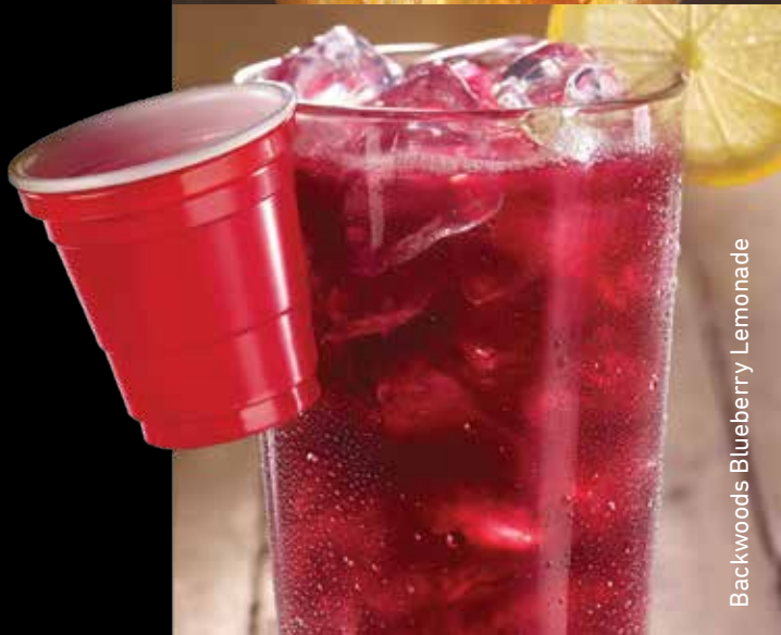
Backwoods Blueberry Lemonade