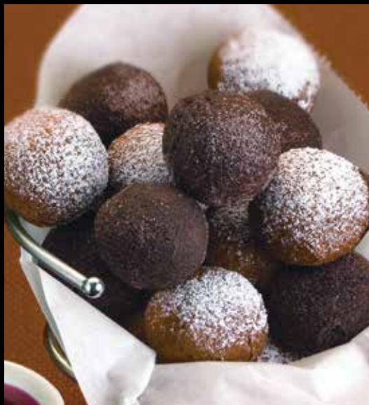
Hot & Sugary Donut Bites