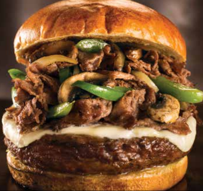
The South Philly Burger*

The Maker's Mark® trademarks, logos, and trade dress are registered trademarks of Maker's Mark Distillery, Inc. and are used with permission.