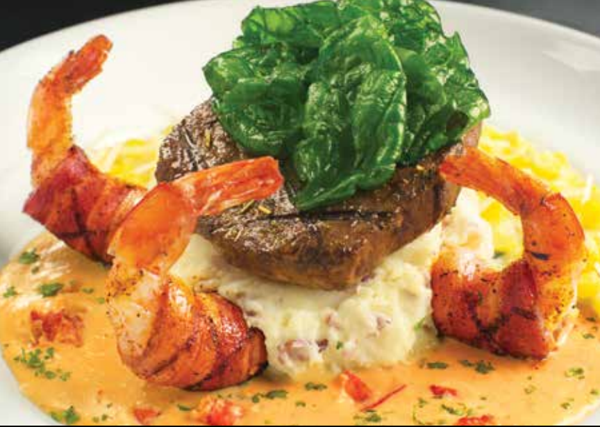
Bacon-Wrapped Shrimp with Lobster Sauce & Fire-Grilled Sirloin*