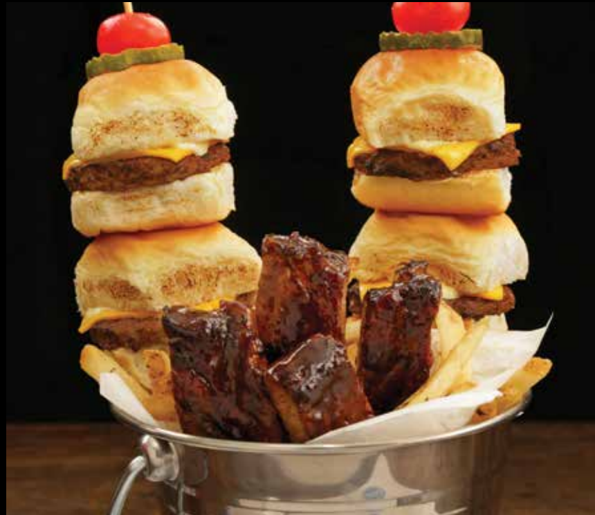
The Caveman Combo