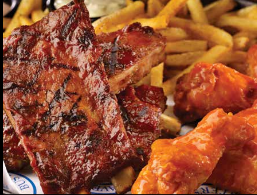
Smokehouse BBQ Ribs & Buffalo Wings

Slow-cooked, tender and juicy "St. Louis-style" pork ribs glazed with honey bourbon BBQ sauce. Served with creamy mac & cheese. Half Rack Full Rack