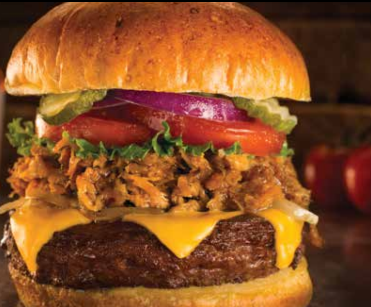
Maker's Mark® BBQ Burger*