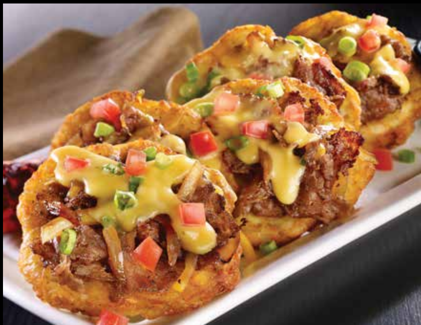
Crispy Steak 'N' Cheese Tater Cakes