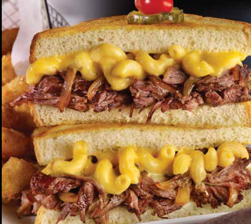
Short Rib & Cheesy Mac Stack

Tender sliced short rib, creamy mac & cheese and bourbon-glazed onions sandwiched between two thick slices of sourdough and grilled to buttery, golden-brown goodness. Served with crispy seasoned tots.