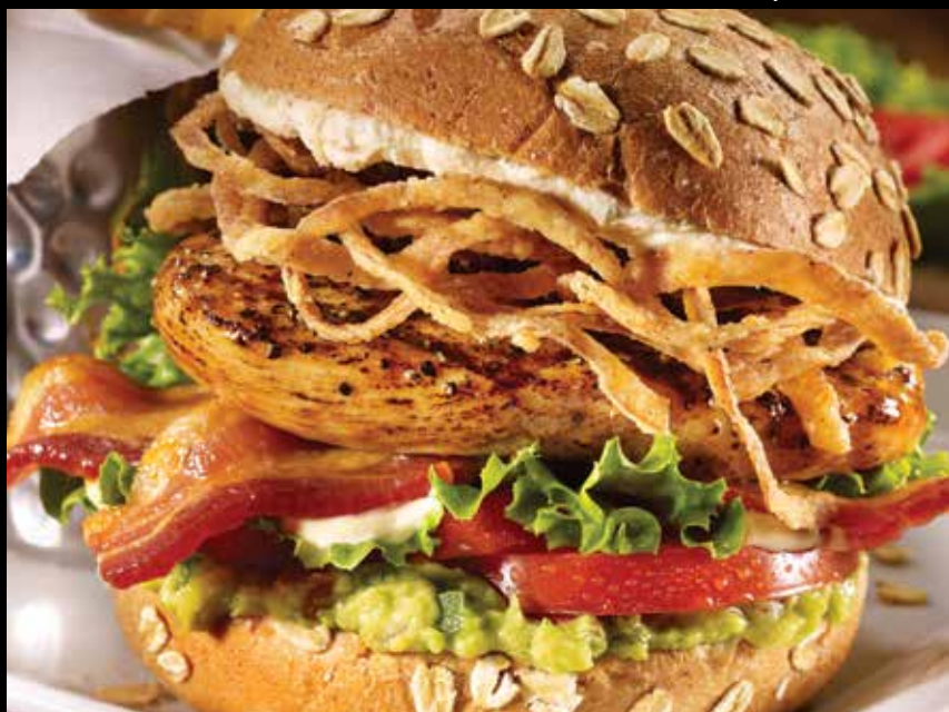
The Boss Chicken Club

Grilled chicken breast, applewood smoked bacon, creamy garlic-herb cheese, lettuce, tomato, avocado spread and frazzled onions on a toasted whole wheat bun with secret sauce. Seasoned french fries on the side.