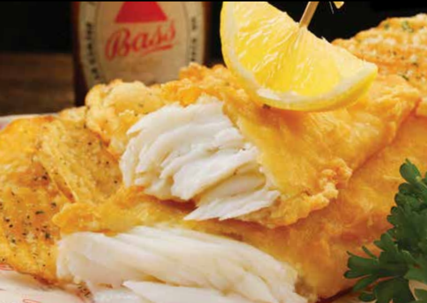
Bass® Ale Battered Fish & Parmesan Potato Chips