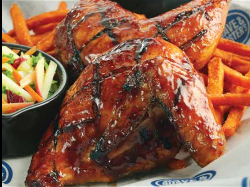
Angry Orchard® Hard Cider BBQ Half Chicken