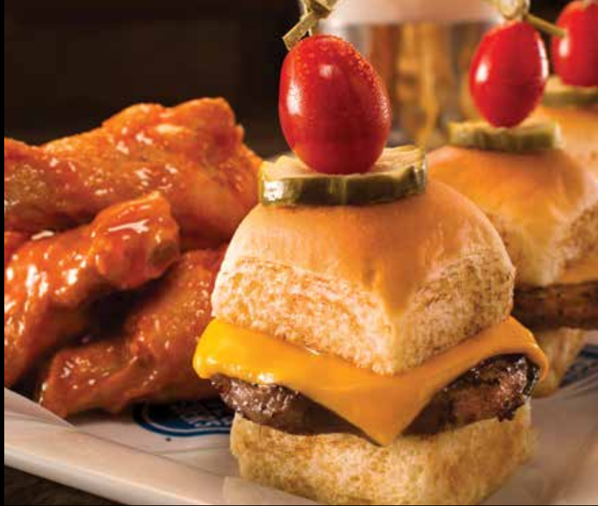
Bar Burgers & Wings Platter

Strips of seared Angus beef slow-simmered with green peppers, beans, diced green chilies, tomatoes and Southwestern spices. Bowl