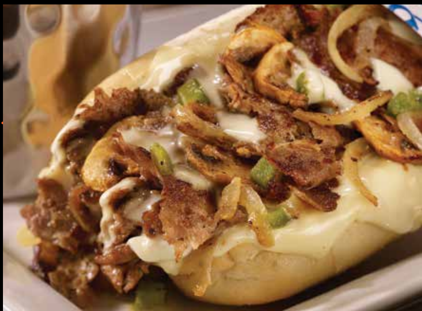
The Philly Cheesesteak

Substitute fries for the salad for no additional charge.