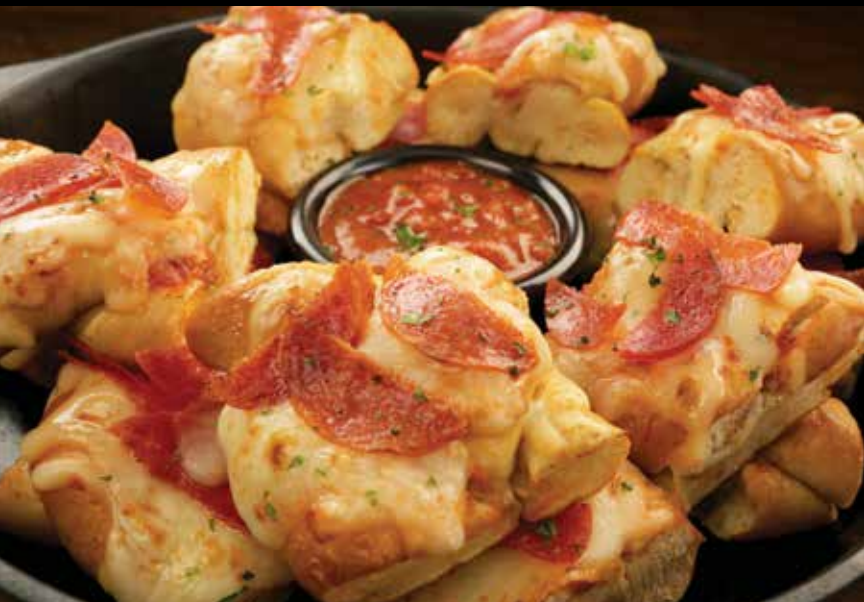
Pepperoni Pretzel Pull-Apart