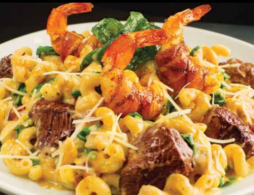
Tenderloin & Bacon-Wrapped Shrimp with Smoked Chile & Tomato Cream Pasta*