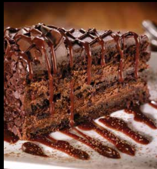
Triple Layer Chocolate Cake