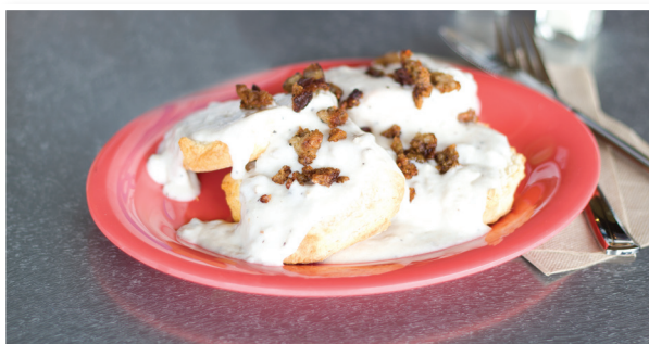
Biscuits and Gravy