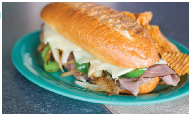
Philly Cheese Steak