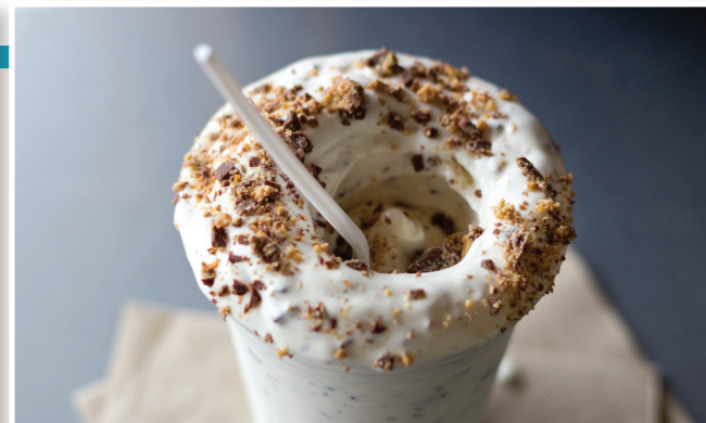
Reese's® Frozen Custard Concrete

Visit fooscafe.com to see a listing of our concrete favorites.