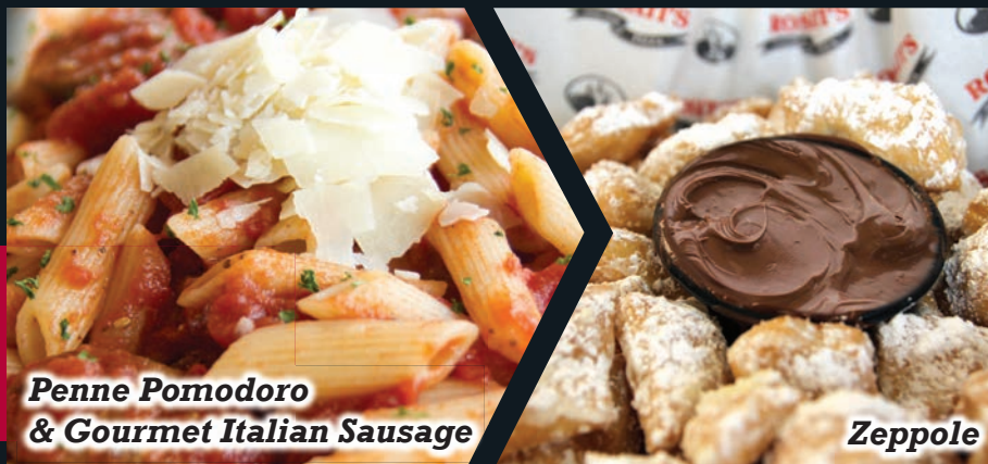
Penne Pomodoro & Gourmet Italian Sausage